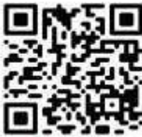
Action to be taken by Nok on Demise of a Family Pensioner