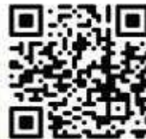
Documents required for Payment of Family Pension to Nok of Missing Personnel