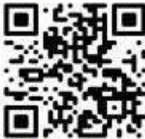
Sainik Rest Houses