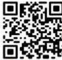
Submission of Life certificate through JEEVAN PRAMAAN App