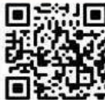
Documents required for endorsement of DOB of SPOUSE in PPO